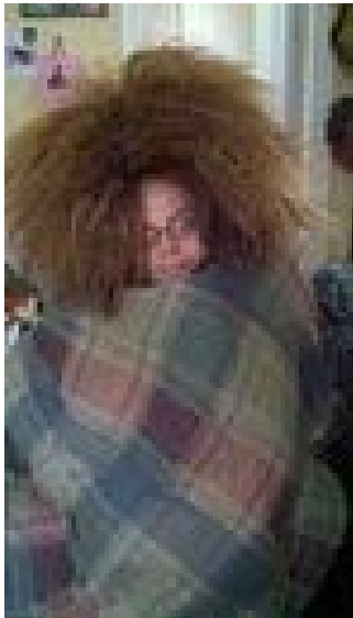
Who is this?

Bring a friend, dance partner or instrument for a free concert at spiritually alive, radically inclusive St. John's UU, 320 Resor Avenue. More info at facebook.com/event.php?eid=105814439522893