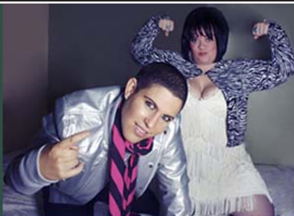
God-Des and She