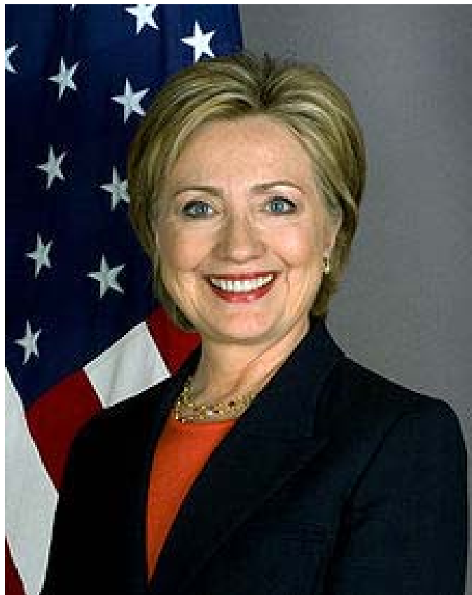
Secretary of State Hillary Clinton

Clinton also announced that the administration is launching a $3 million global equality fund to support the work of civil society organizations working on these issues